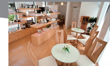
| Funeral Consultation Center